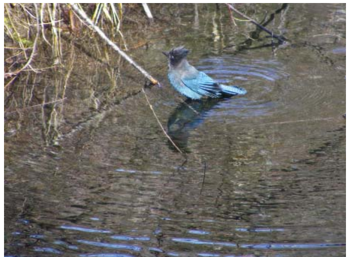
A Stellar's Jay enjoys a morning bath

President and Vice President: We welcome any and all suggestions for filling these two positions.