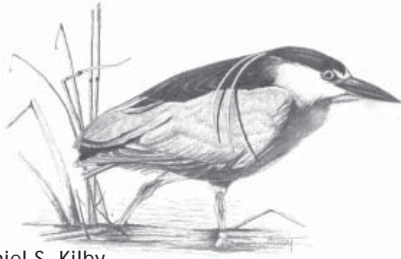
Daniel S. Kilby

As I sit in front of my computer on a lovely spring-like morning, there are Pygmy Nuthatches attempting to create cavities in the wood siding on both the north and south side of our house and a Northern Flicker drumming for attention on the metal roofing! Mule deer and chipmunks (my Montana friends refer to them as Saber-toothed timber-tigers) taunt our dogs into a frenzy before eating most of the black oil sunflower seed I put out for birds regardless of where I hang the feeders. Ah, living the peaceful life in the country.