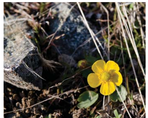
My first wildflower of the year Sagebrush Buttercup

Many other WNPS outings are listed on their website www.wnps.org/chapter_info/wenatchee/home.html . No doubt that in addition to seeing and learning about native plants, there will be birds to see and identify along the way.