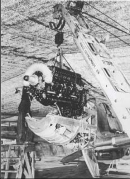
2. The Merlin Engine marries the Mustang P-51 Chassis. There are many photos of this "marriage," including those in Rolls-Royce's own historical series. This is a later one, showing a Packard-Merlin being lowered in, under a camouflage net, from Paul A. Ludwig's authoritative P-51: Development of the Long-Range Escort Fighter.

altitude of 44,000 feet, never stall, turn on a penny, and manoeuvrable at any height, plus , the greatest boon of all, a low drag and fuel economy that could take it further into Europe than any other Allied fighter. With the newly introduced drop fuel-tanks, a parallel improvement, it could accompany the B-17s to Prague and back; actually, by late 1944 Mustangs could accompany Allied bombers from East Anglia to airfields in western Russia.