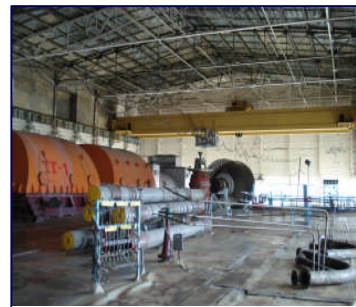
Fig. 5 Chernobyl NPP, Ukraine

There has been a considerable increase in requests for IAEA technical assistance in the field of decommissioning throughout the past few years. In response the IAEA has been working closely with the Member States having NPPs and research reactors that are close to decommissioning. Assistance has been provided in a number of areas [31]. These include the review and development of legislation (e.g. Georgia, Serbia); the selection of decommissioning strategies (e.g. Armenia, Bulgaria); development and review of decommissioning plans (e.g. China, Kazakhstan, Hungary, Uzbekistan, Ukraine, Romania); review of cost estimation methodologies for decommissioning (e.g. Russia, Ukraine, China); development and review of safety assessments for decommissioning (e.g. Ukraine, China), carrying out of radiological characterization (e.g. Armenia), development of decommissioning databases (e.g. Ukraine). This assistance has been provided at both a national and regional level and will be continued into the next Technical Cooperation Cycle (2009-2011) and beyond and it is intended to extend this assistance to other regions such as Latin America and Africa.