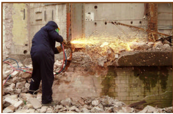
Fig. 2 Decommissioning activities in UK