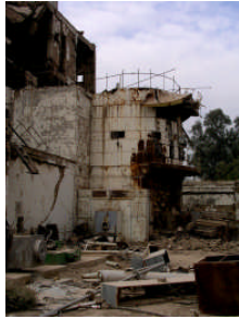
Fig. 4 IRT-5000, Tuwaitha site

A number of former nuclear sites in Iraq are extensively contaminated and require the remaining facilities to be decommissioned and the sites cleaned up to ensure safety both in the near and in the long term (many of the facilities are located at the nuclear research centre at Al Tuwaitha near Baghdad). Since 2006 the IAEA has been providing assistance to the Government of Iraq in evaluating and planning for the decommissioning of these facilities with the focus on [31]; collection and analysis all available data (Phase 1); training of local staff (Phase 2); and development of a decommissioning and remediation plans (Phase 3). A multinational team of experts is currently working on (i) data collection and analysis, (ii) development of a system to prioritize the work; (iii) development of decommissioning and waste management strategies; and (iv) development of a law and relevant regulations.